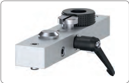
Drill jig with clamping lever

Application Tools for precise machining of connection bore • for drilling machine: - drill jig - drill • for milling machine: - milling cutter • the drill jig is located and fastened in the profile slot • suitable for any profile angle cut