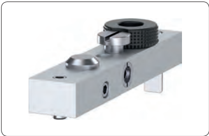
Drill jig with setscrew